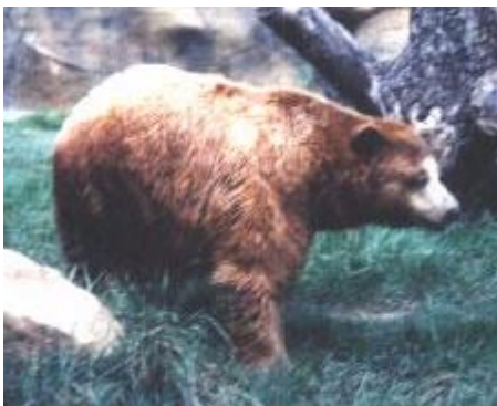
The late "Samson The Jacuzzi-loving Bear"